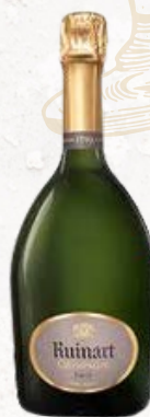
RUINART Brut WHITE 75cl XCD 355.00