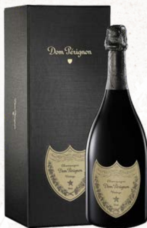
DOM PERIGNON COF Vintage WHITE 2009 75cl XCD 1350