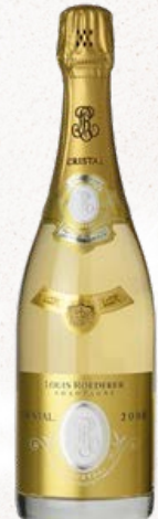
LOUIS ROEDERER Crystal Roederer Vintage 2008 75cl XCD 1420.00