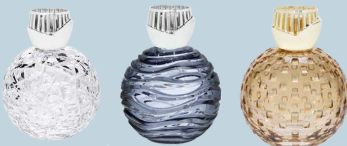
Crystal Handmade Lamp and reed Diffuser