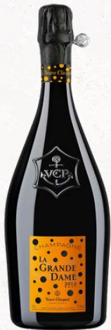
VEUVE CLICQUOT La Grande Dame 2012 75cl XCD 985.00

The aromatic notes and sensory impressions of each Champagne. The magic of blending lies in the combination of different aromas.