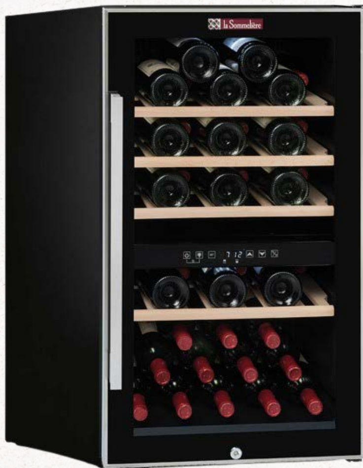
Cave à vin ECS50.2Z double zone 49 bouteilles

Now you can store your wine in the comfort of your home. Faye Gastronomie Caraïbes is thrilled to present to you our Sommeliere Wine Cellars !