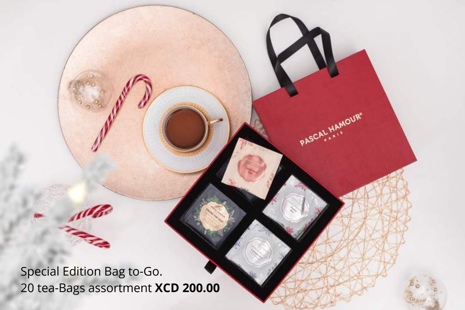
Special Edition Bag to-Go. 20 tea-Bags assortment XCD 200.00