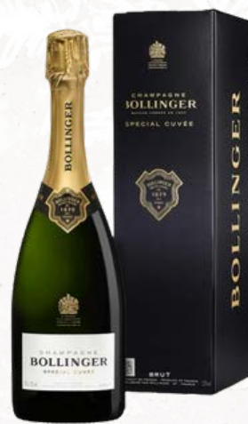
BOLLINGER Brut Cuvée Spéciale 75cl XCD 295