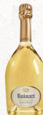
RUINART Blanc de Blanc 75cl XCD 485.00