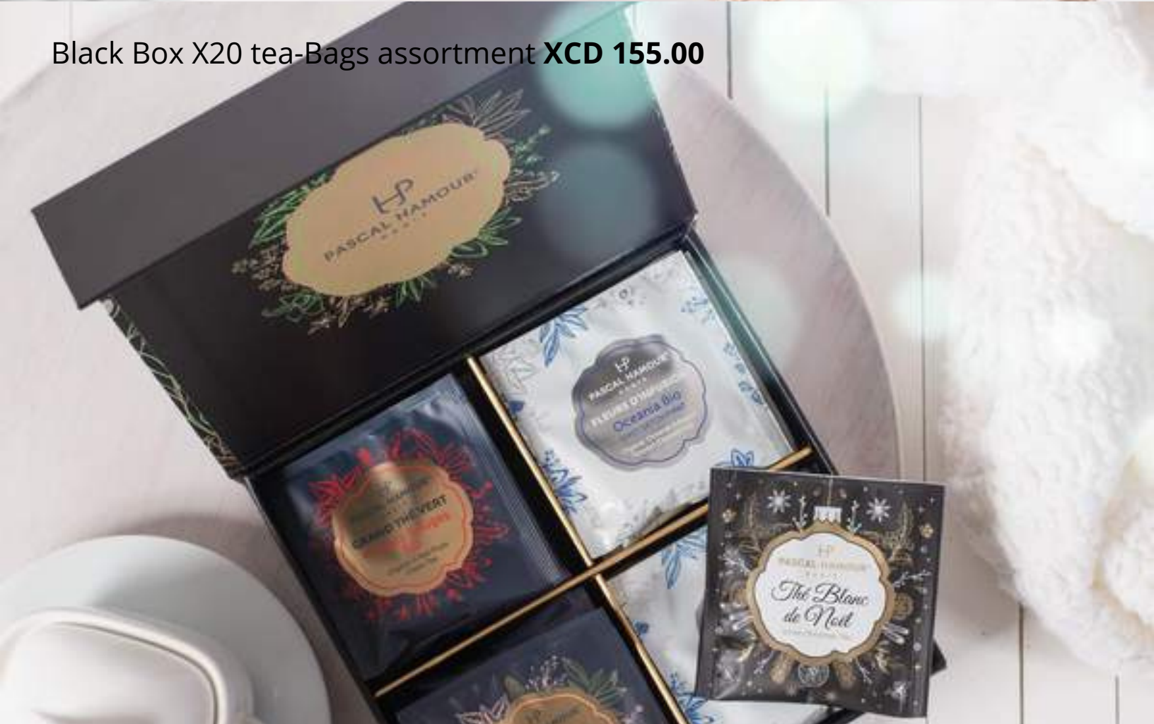
Black Box X20 tea-Bags assortment XCD 155.00