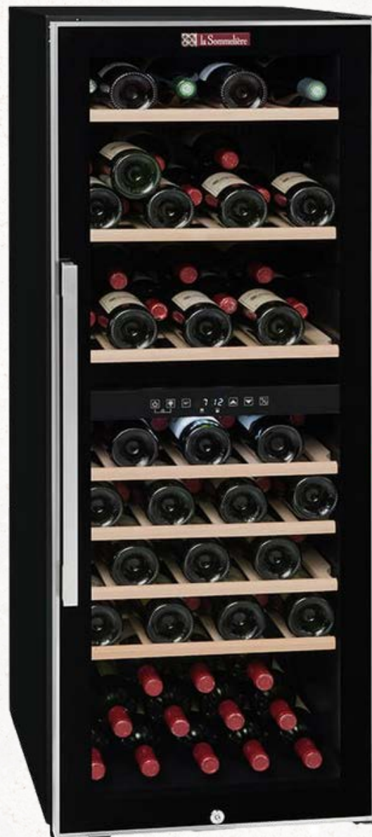
Cave à vin ECS80.2Z double zone 75 bouteilles