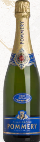
POMMERY Brut Royal WHITE 75cl XCD 195.00