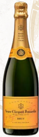
VEUVE CLICQUOT Ponsardin Yellow Brut 75cl XCD 189.00