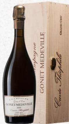
DOMAINE GONET-MEDEVILLE Cuvée Theophile WHITE 2006 75cl XCD 355.00 1.5L XCD 1035.00