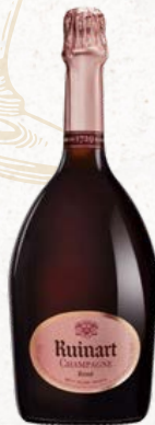
RUINART BRUT ROSÉ 75cl XCD 365.00