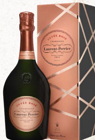
LAURENT PERRIER BRUT CUVEE ROSE 75cl XCD 476.50