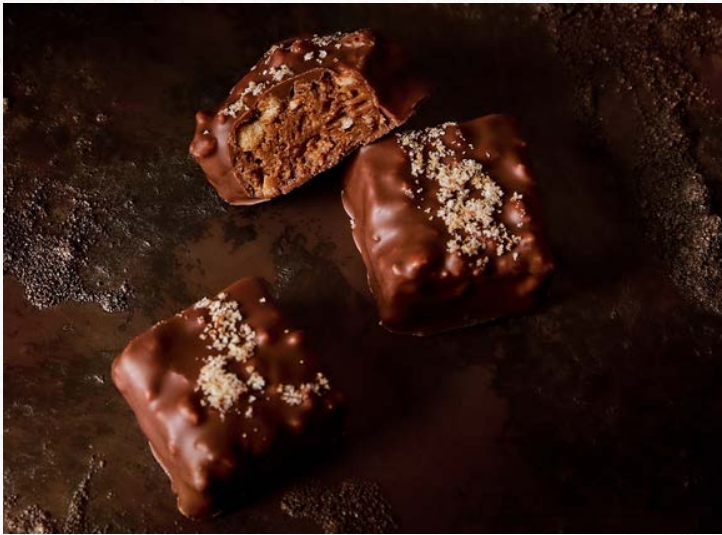
Retail price: XCD 135XCD

Experience the new gourmet creation by CLUIZEL, the perfect blend of La Laguna 47% milk chocolate, sweet figs and crunchy caramelised hazelnut pieces.