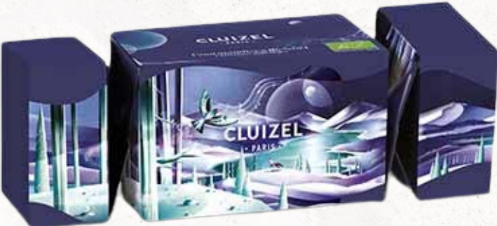
Retail price: XCD 45.00

Experience the new gourmet creation by CLUIZEL, the perfect blend of La Laguna 47% milk chocolate, sweet figs and crunchy caramelised hazelnut pieces.