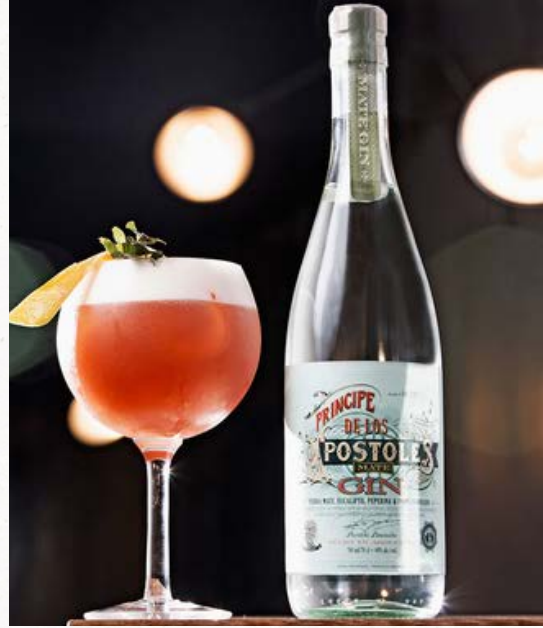
Gin Principe de Los Apostoles