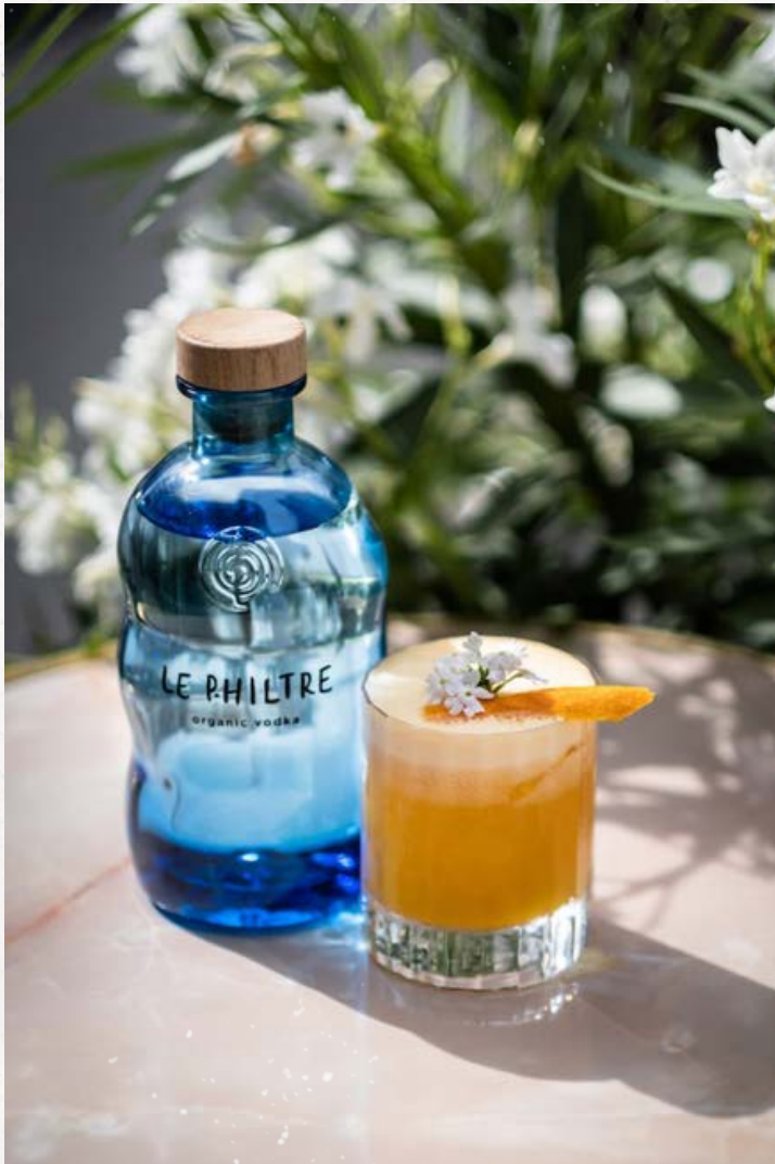
Le Philtre – Cognac Region France – Organic Vodka - 70cl