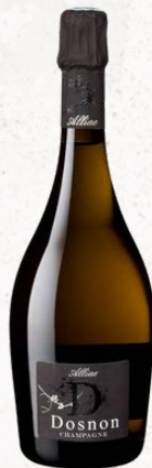
HENRY DOSNON Alliae Brut Nature WHITE 75cl XCD 295.00